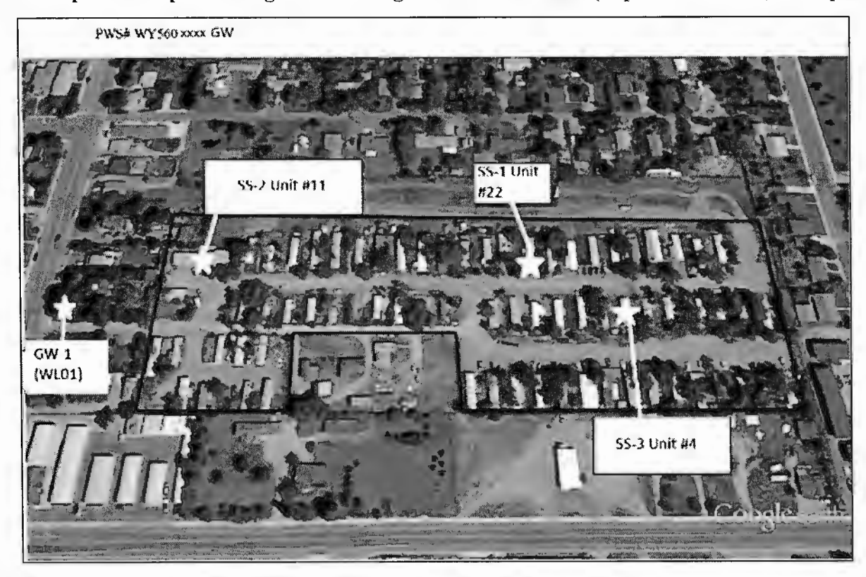
Example 2: Chart - Multiple Sources/Multiple Distribution (Population ≤ 1000; 2 samples/month)